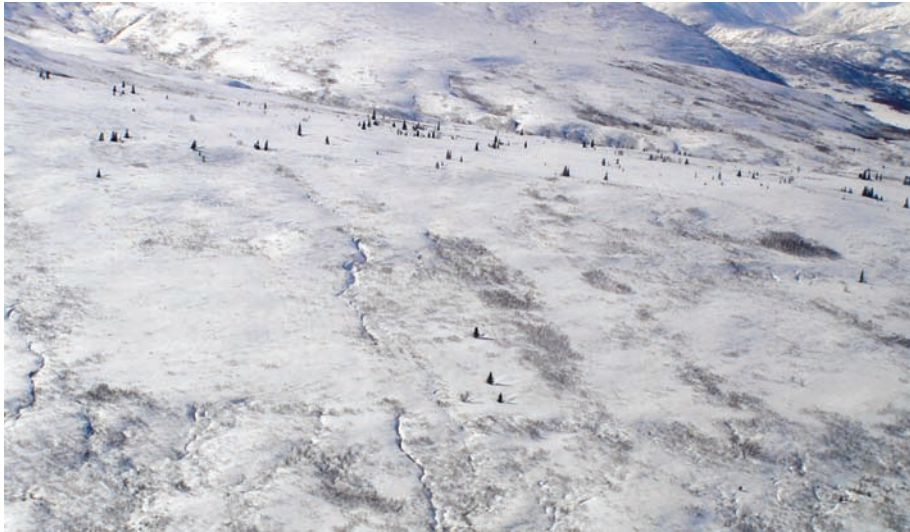
Fig. 2. Sparsely distributed spruce considered to be analogous to glacial-refuge populations. DNA and fossil pollen data suggest that such small populations survived the Last Glacial Maximum in Alaska and that they were important for boreal-forest development after the end of the last glaciation (7).

environments probably tens of kilometers from ice sheets (8, 9) and even in ice-free areas north of ice sheets (7). Thus, it appears that small populations of trees can endure extreme climatic conditions for tens of thousands of years (Fig. 2).