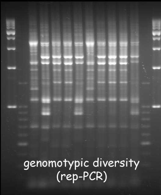
genotypic diversity (rep-PCR)